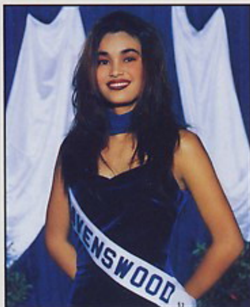
Miss Teen Illinois Pageant.