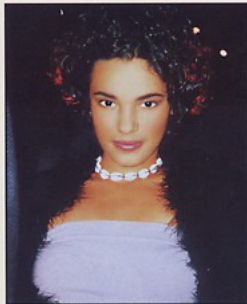
A Night out with my friends.