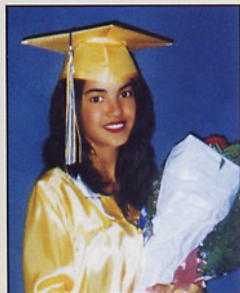
Me at my eighth grade graduation.